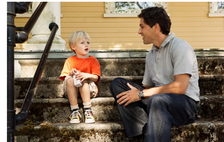
Lift up a child's voice. A child's life.™

In fiscal year 2013/2014, CASA of Northeast TN over 400 children in Greene, Unicoi and Washington Counties with 68 dedicated volunteers. However, there were still hundreds of children who were left without an advocate. You can make a difference in a child's life. Volunteer today!